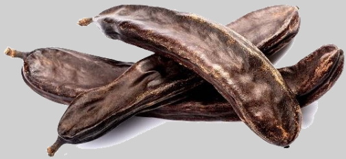
Carob bean pods